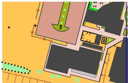
Example of the detailed map of Hartismere School

The new Hartismere Orienteering Club is a satellite of Suffolk Orienteering Club which is registered with British Orienteering. Club sessions will be held fortnightly based at Hartismere School. Qualified coaches will be on hand to teach you all the skills you need in a fun and friendly atmosphere. If you want hard training they'll guide you but if you just want to try out a new sport – or brush up the skills you've already got – then make contact and come along. All ages and abilities welcome.